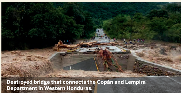
Destroyed bridge that connects the Copán and Lempira Department in Western Honduras.