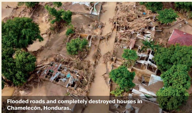
Flooded roads and completely destroyed houses in Chamelecón, Honduras.