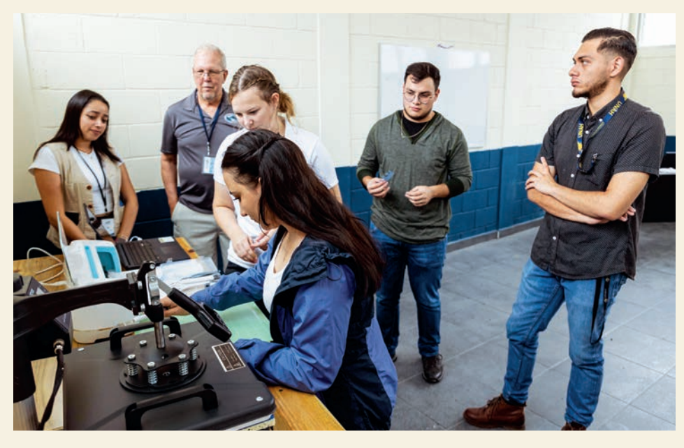
The Romich MakerSpace team trained students at the Trade School during the Fall brigade.

a name and "Makers of Ohio" was decided upon, or the "Moo Crew." The Moo Crew spent nearly a full day installing and testing the new equipment and spent the rest of the week instructing the four future trainers in its use.