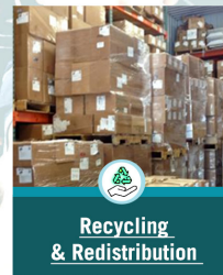
Recycling & Redistribution

The Campaign to Sustain Health and Education of CAMO's Services in Honduras aims to secure $2 million to facilitate the expansion of CAMO's facilities and capabilities in Honduras. The upgraded facilities will improve medical services and create dedicated areas for training, education, and revenue-generating services.