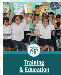
Training & Education