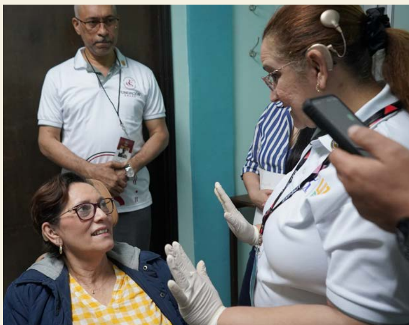
Around 104 people who couldn’t afford a hearing aid received this priceless gift that will transform their lives.

In a meaningful example of its social commitment, INSSA recently partnered with Fundación Luz en el Fondo del Alma to distribute 189 hearing aids to individuals in need—restoring hearing, dignity, and connection for 104 people.