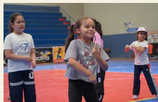
Over 700 daily visitors to the Community Center & Gym directly benefit from this donation.