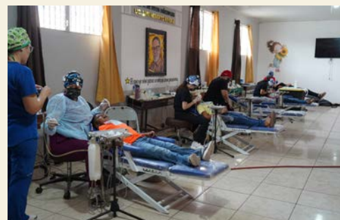
Medical brigades represent equitable access to essential services, saving lives and closing health gaps in underserved communities.