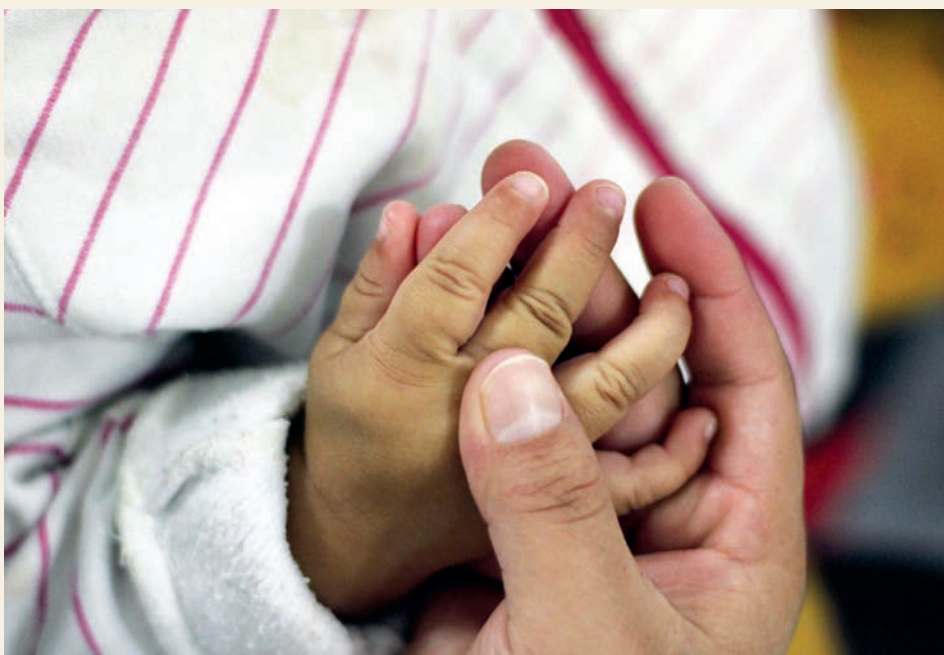
A mother holds her young daughter's hand with the faith that they will break the cycle of violence.

With training and support, these women are not just surviving—they are building new lives on their own terms.