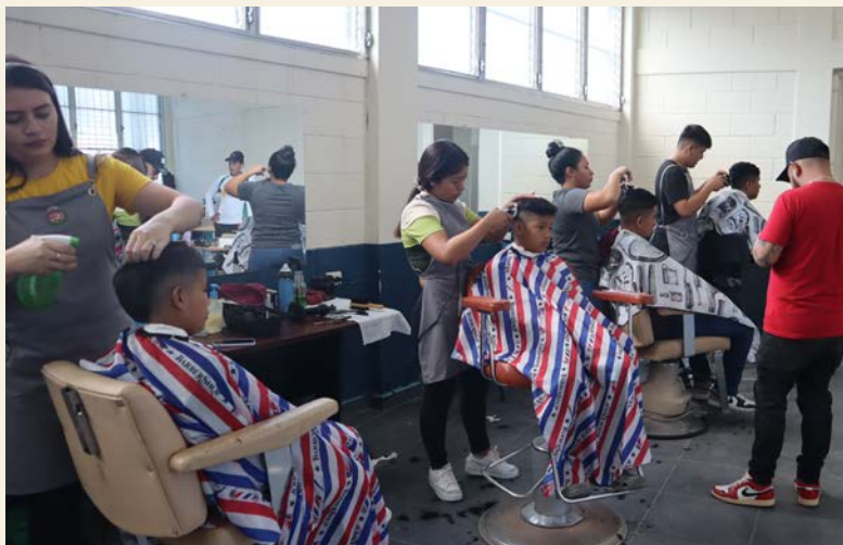
Women training in barbering at the Trade School Training Center.