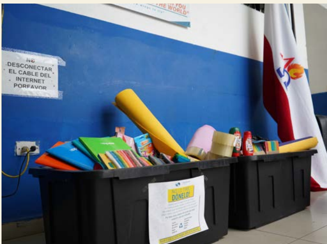
Donated supplies will support 16 rural schools, shaping brighter futures.

Your donation of school supplies—or a financial gift to support this effort—can give a child the chance to succeed, to stay in school, and to believe in their own potential. Together, we're not just donating supplies. We're building futures.