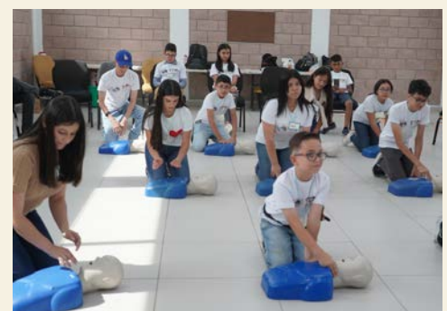
Twenty-four children received CPR training and enjoy volunteering.