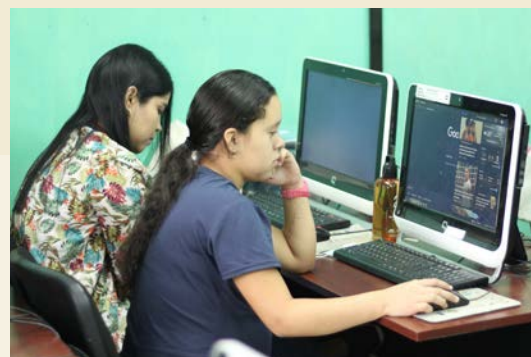
Women training in computer skills at the Trade School Training Center.

In Latin America, where many women feel forced to stay in unhealthy or dangerous relationships due to